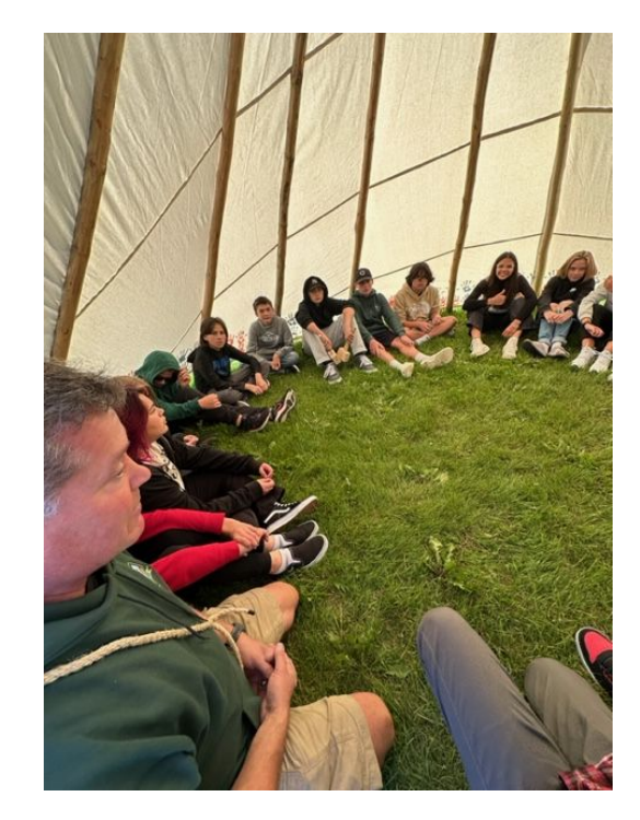
Our students learned about the tradition of building a teepee and the residuals of residential school.