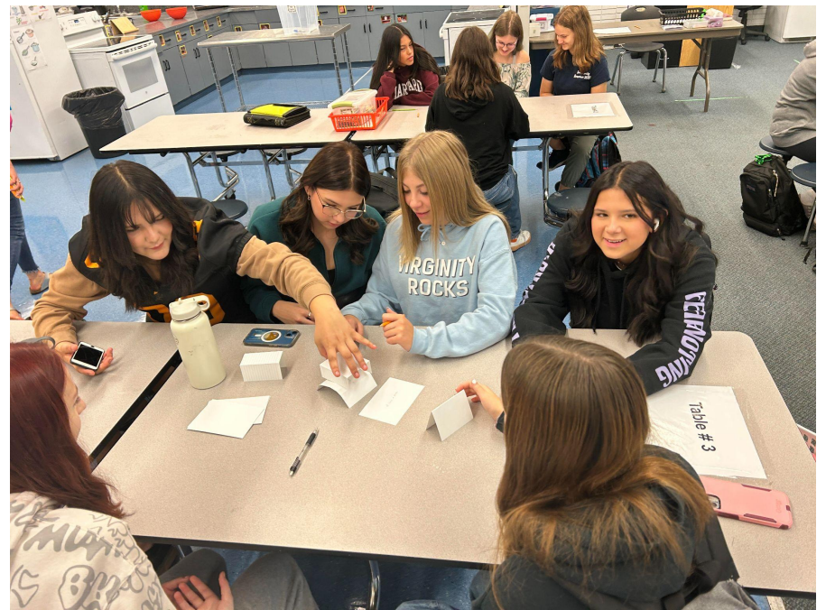
Grade 9 building challenge using decks of cards!!!